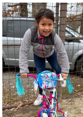
67 Bicycles and 10 scooters were given away to some very happy children thanks to all of you who donated bicycles!