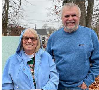
We are so blessed to be a part of a ministry that has so many volunteers standing with us to serve the needs of our community. God Bless you all!