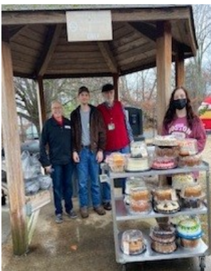
A favorite part of the meal to many people. It was a blessing to see the faces light up when they were given a whole cake or pie for their families.