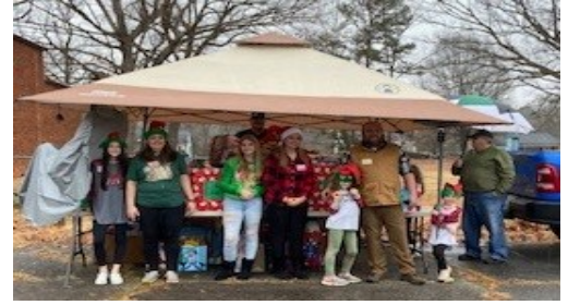
It was such a blessing to see all the young people that came out to help give out all the toys that were donated for the Christmas Community meal. Thank you!!!