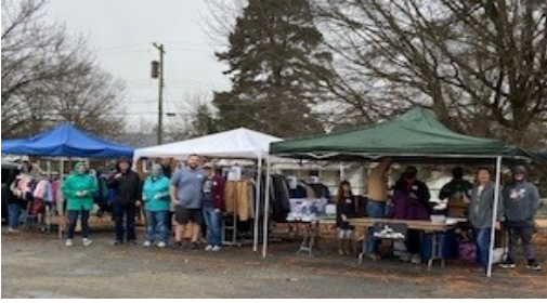
Thank you to the volunteers that gave out the coats, hats, scarves and gloves while the rain poured down on the them.