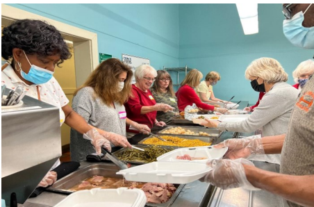
Filling the takeaway plates full of delicious food for a Christmas meal. Thank you Volunteers for standing there serving for almost 3 hours.!