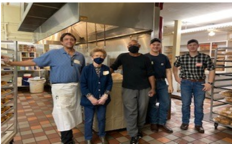
Thank you to the kitchen staff who worked for days to prepare the Christmas Meal for approximately 400 people .