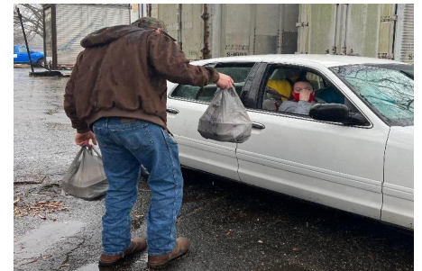
Loading the cars with the plates and deserts for everyone in the family.