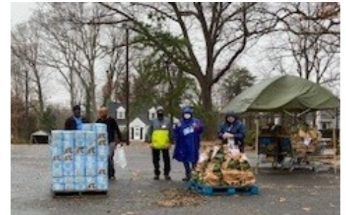
God blessed us with an abundance of food boxes to give away at the event. Each car received 4 boxes and 4 bags of food for meals to cook at home for several days.