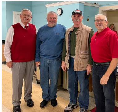
We are so thankful to PRM board members who took the time to come out and work beside us in serving the community!